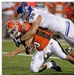
3 B.C.S. Party Crashers Likely to Stick Around