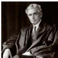
A Biography of Louis D. Brandeis