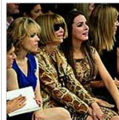
Cuts Meet a Culture of Spending at Condé Nast