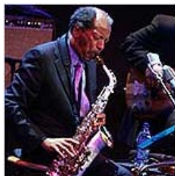
Ornette Coleman, Starring as Himself